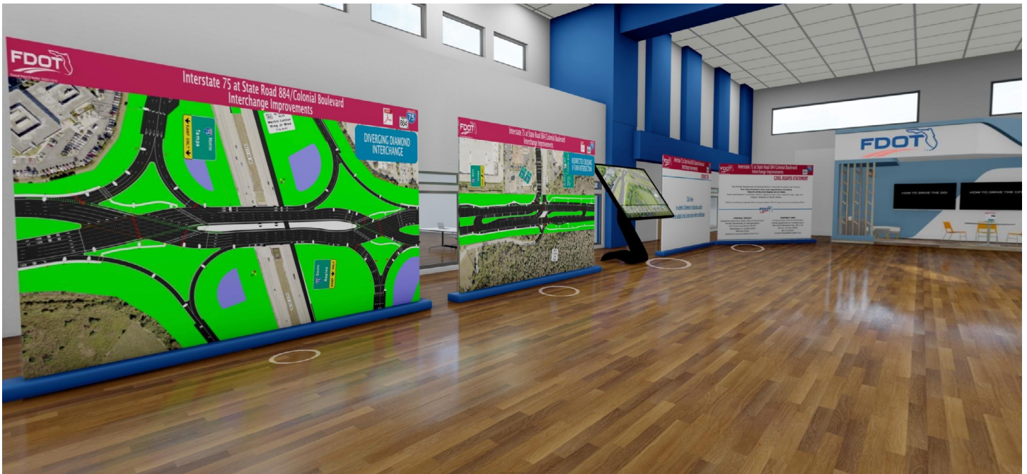
Click image above to enter the I-75 at S.R.884/Colonial Blvd Virtual Public Meeting

“ Utilizing the visual assets of the 123BIM Model, the public fully understood the innovative I-75 at Colonial Boulevard Interchange Improvements project since they could see the final configuration.”