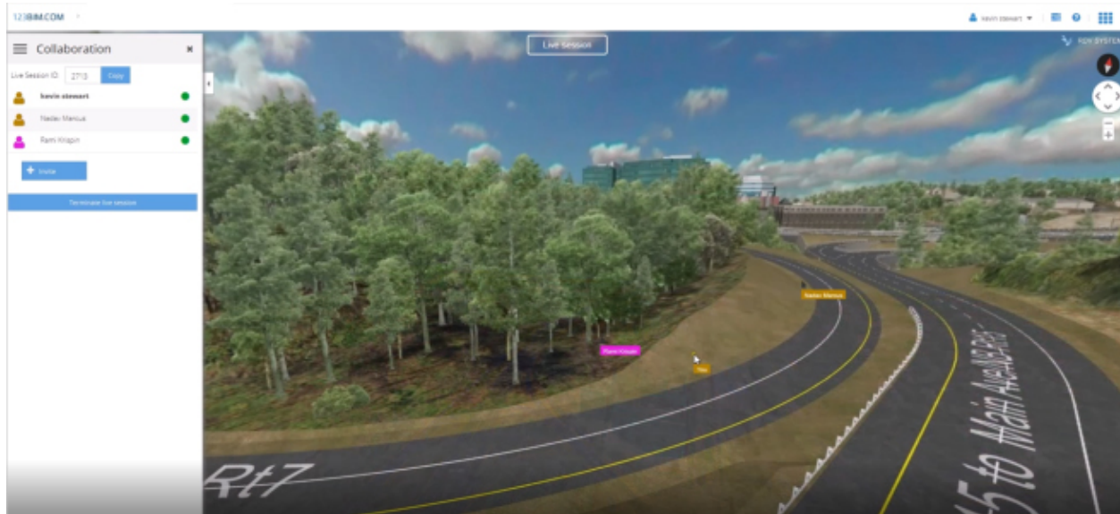
Figure 3 - 123bim Collaboration Session with Multiple Participants

common web browsers such as Chrome, Edge, and Firefox. 123BIM also provides a managed environment where the project administrator can set the appropriate level of access for each team member, e.g., Viewer, Collaborator, or Modeler.