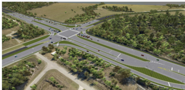
S.R. 82 Continuous Flow Intersection

The resulting storyboard video was used in FDOT’s public education meetings and posted on the project website for expanded outreach ( click here ).