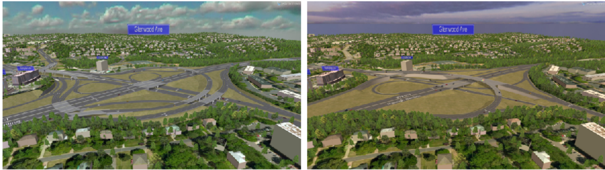
Figure 5 - Exported Image Files of Two Interchange Alternatives

controls to instantly change the sky background, time-of-day, and lighting and shadow settings to their liking. Figure 5 shows exported JPEG files of two interchange design alternatives with different environment settings, a process that took less than one minute to complete.