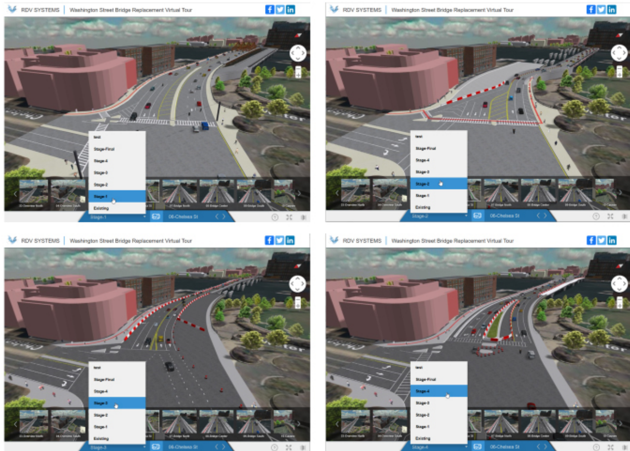
Figure 4 – Virtual Tour Showing Maintenance-of-Traffic Details for Multiple Construction Stages

For example, Figure 4 shows a virtual tour of the maintenance-of-traffic plan for the North Washington Street bridge replacement project in Boston, MA. Using a simple web link ( https://vtour.123bim.com/AAGV ) team members are able to see 360-degree views from over twenty viewpoints for six traffic configuration stages.