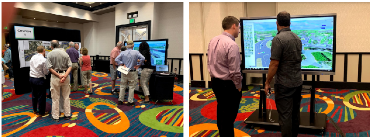
Figure 6 - Touch Screen Virtual Tours Used at a NCDOT Public Meeting

The role of Virtual Tours of RDV models for design team collaboration and stakeholder outreach has already been described. However, the primary use of the Virtual Tour is to share information with the public. Virtual tours make it easy to share the 3-D project model in a simplified web-hosted interface that is accessible on computers, phones, and tablets. RDV clients often post links to 3-D virtual tours on project websites, include links and scannable QR codes on brochures and hand-outs, and provide touch-screen virtual tours at open house meetings. In addition, Virtual Tours include single-click instant posting to social media platforms, making it easy for viewers to share with their social networks.