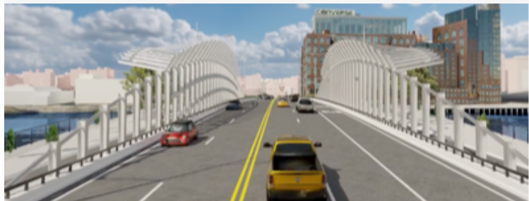
North Washington Street Bridge Replacement

Once the 3-D project model was delivered, the project team realized that it provided the most effective way to review the details of the proposed maintenance-of-traffic plan with the city engineers and with the Metro Transit Authority prior to the public meetings. These reviews resulted in several significant changes to the traffic flow layout at the signalized intersections on both sides of the bridge. The changes were incorporated into the model and the updated plan was shared with the two agencies using a Virtual Tour for final review and approval.