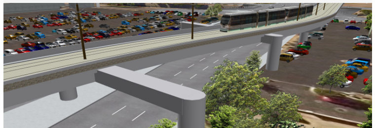
Figure 2 - Project Example

Upon reviewing the initial version of the 3-D project model, the designers realized that the rail bridge on the SPUI alternative did not have adequate structural support. Additional columns, including three straddle bents, were quickly designed and incorporated into the 3-D project model. The design team was then able to evaluate the impact of placing large support columns in the parking lot of an adjacent car dealership, and this turned out to be a major factor in evaluating the alternatives.