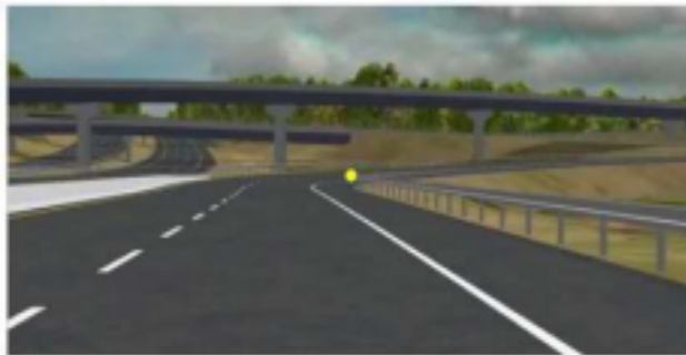
Sight Distance Analysis on Proposed Interchange (3-D model built from CAD data)

RSA-3D Technology was recently utilized in a breakthrough study done by Michigan State University, utilizing Utah DOT data and proved conclusively that the value of high-fidelity LiDAR data, allowed for a large-scale investigation of the relationship between crash risk and available sight distance on a diverse set of roadway facilities. Negative binomial regression models were estimated separately for freeway and non-freeway facilities while controlling for the effects of other important variables. Click here to read the study.