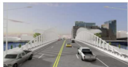
Massachusetts DOT North Washington Street Bridge Replacement – Boston MA