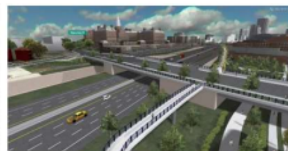
Connecticut DOT I-84 Viaduct Replacement Study – Hartford CT

CLICK HERE TO SEE THE DIFFERENCE BETWEEN OUTDATED SIGHT DISTANCE METHODOLOGY VS. RSA-3D TECHNOLOGY