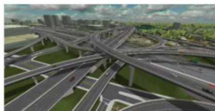
Florida DOT Interchange Upgrade for Median Express Lanes – Orlando FL