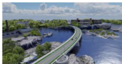
Maine DOT Frank J Wood Bridge Replacement – Brunswick, ME